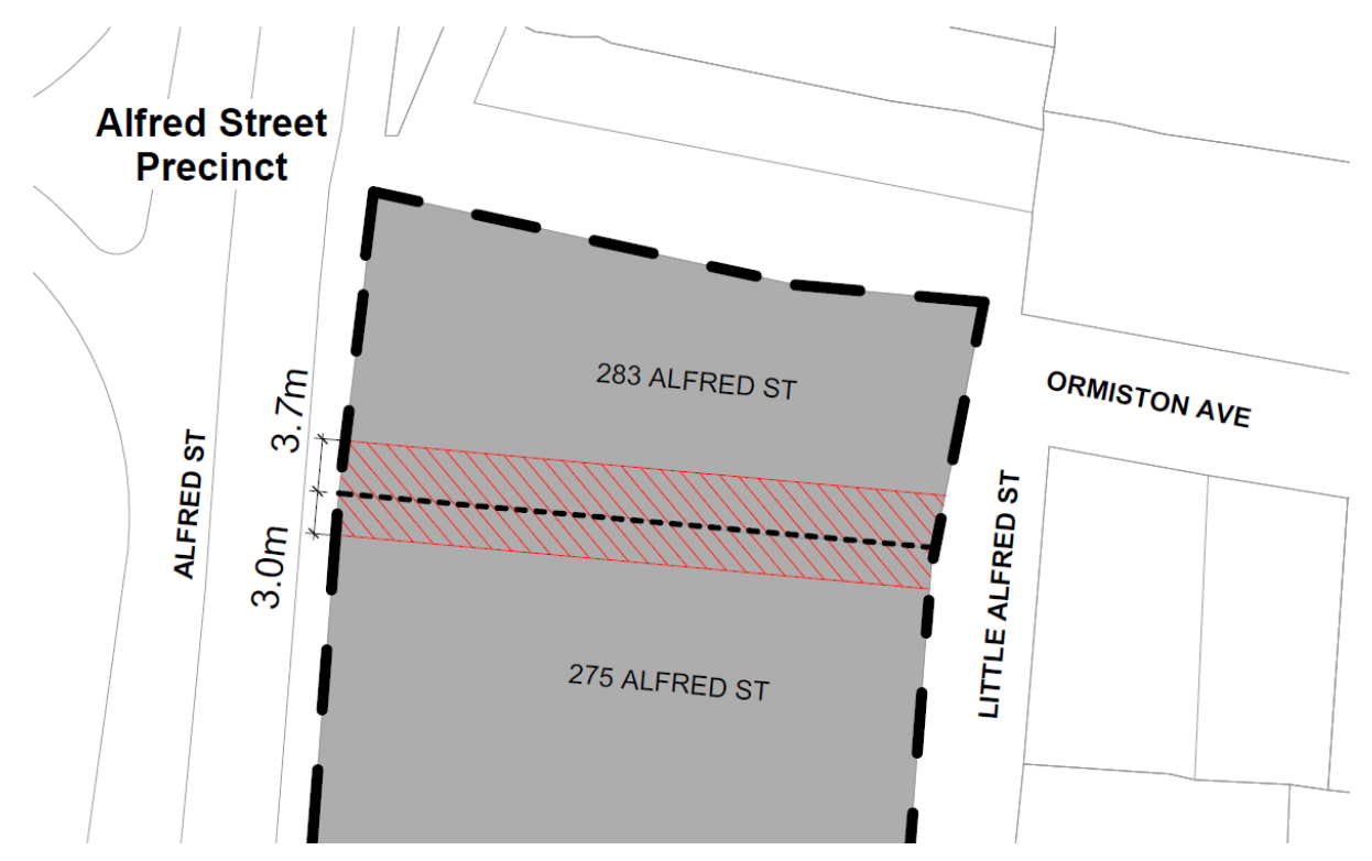
Figure 2 - Through Site Link (hatched red)